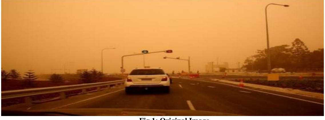
Fig 1: Original Image