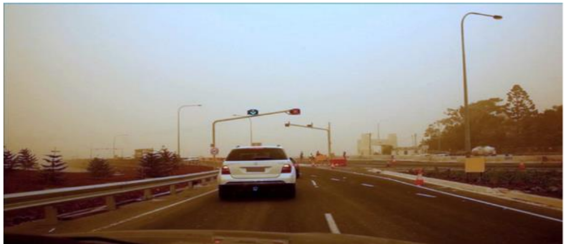
Fig 4: Image after Guided Image Filtration