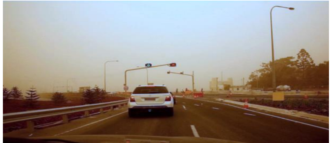
Fig 3: Image After White Balancing