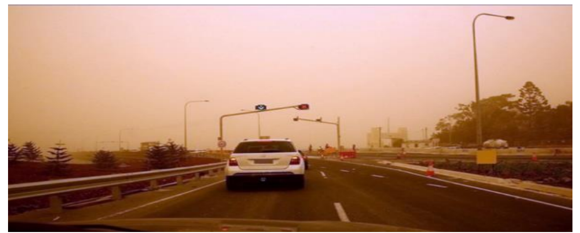
Fig 2: Image after Blue Channel Compensation